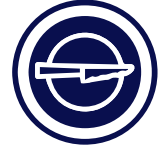
High Scratch Resistance