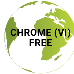
Chrome (VI) Free